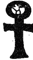
St. Alban Catholic Schools' Partnership

The schools of the St Alban Catholic Schools' Partnership are dedicated to their pupils achieving the greatest success possible.